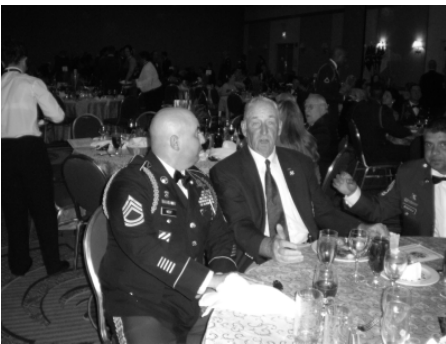
SFC West & CSM Twomey