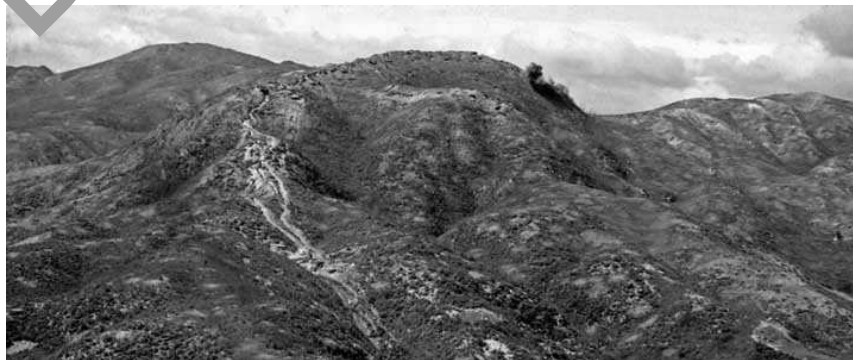
Photo of Outpost Harry, June 15, 1953.