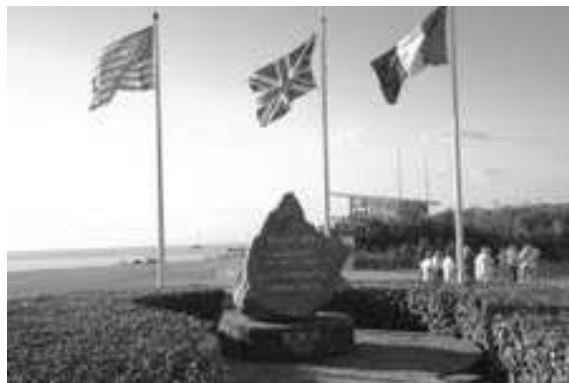
Ramatuelle 7th Army Monument and 3ID Plaque on 15th Infantry's Landing Beach